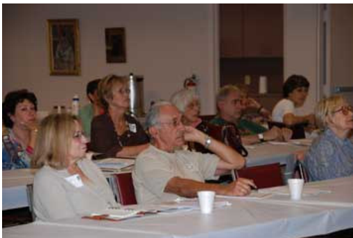
Our eager genealogists!